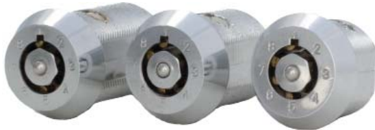
Cobramatic 7 Series

All Cobramatic Series locks feature 8 key code changes designed so that the user can change the key code while the lock is still mounted with no outward visual indication of what the current key code is.