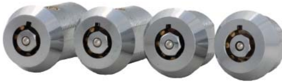
Cobra 7 Series

The Cobra 7 Series incorporates the original design of current tubular cam locks such as the ACE®, Gem® and others with our new and improved face and 7-Sided lock spindle and key.