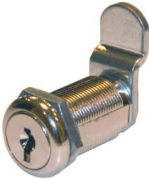
Cobra SB Series

The Cobra disc wafer single bitted cam locks are designed for a variety of OEM applications. The lock is a die-cast construction, with brass wafers.