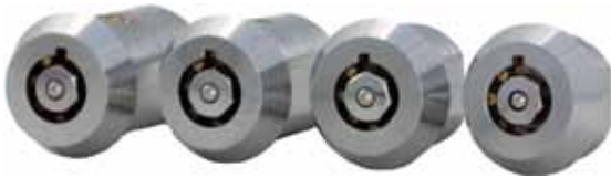
Cobra 7 Series

The Cobra 7 Series incorporates the original design of current tubular cam locks such as the ACE®, Gem® and others with our new and improved face and 7-Sided lock spindle and key.